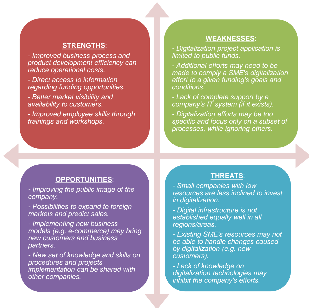
Figure 3. SWOT analysis of private sector-level practices and tools across countries/regions.

category of initiatives provides more detailed insights into the entire digitalization process and various benefits that it brings to SMEs in terms of business process and product development efficiency.