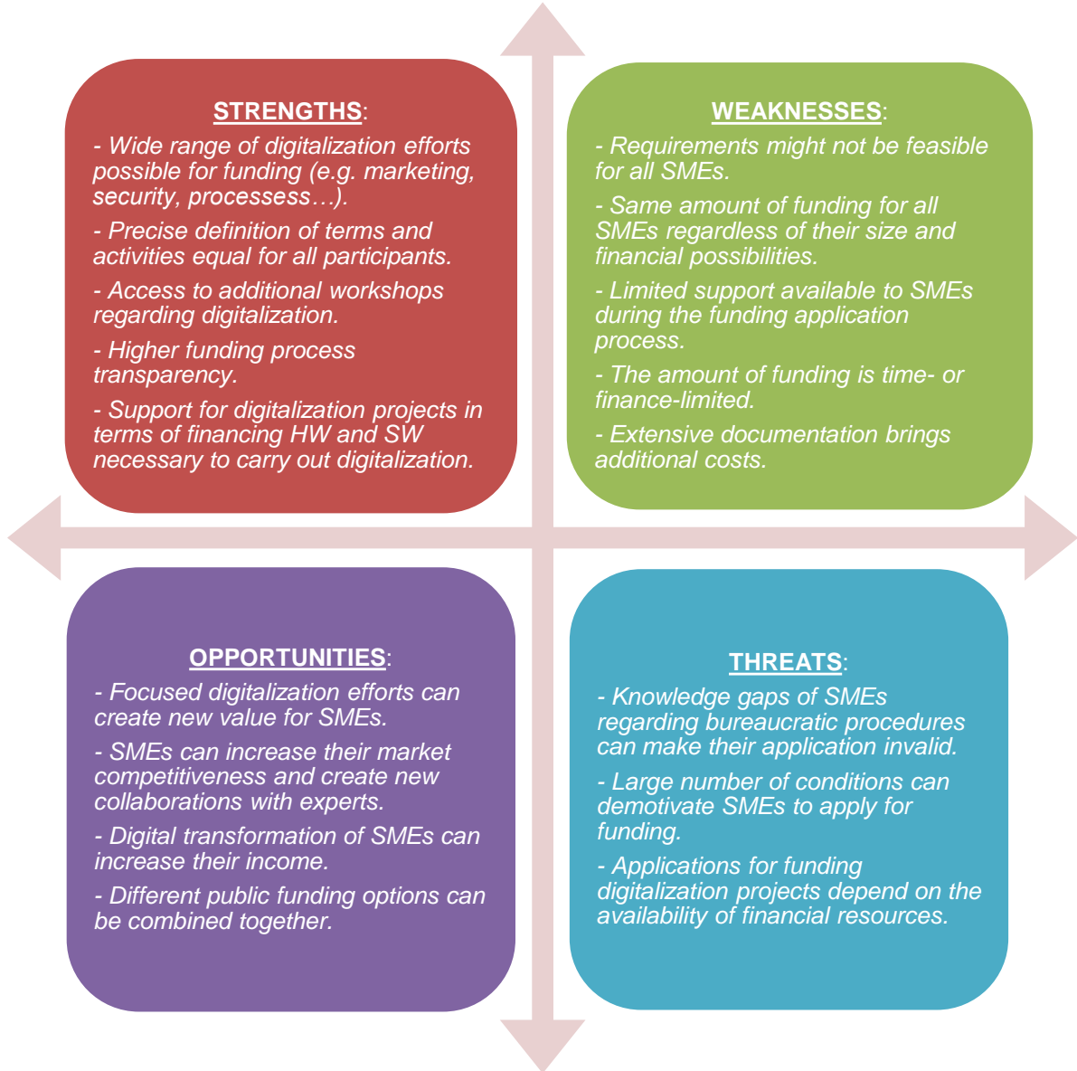
Figure 1. SWOT analysis of government-level practices and tools across countries/regions.

increased competition due to limited funding can discourage SMEs with limited resources to invest part of their resources into the project application.